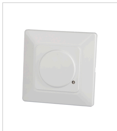
VT-8023 MICROWAVE SENSOR