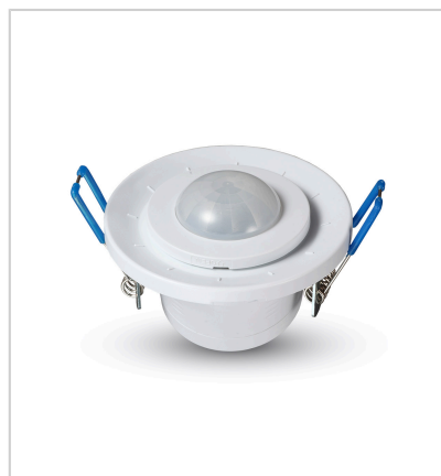
VT-8030 PIR CEILING SENSOR WITH MOVING HEAD