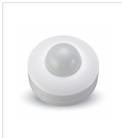
VT-8049 INFRARED MOTION SENSOR-WHITE