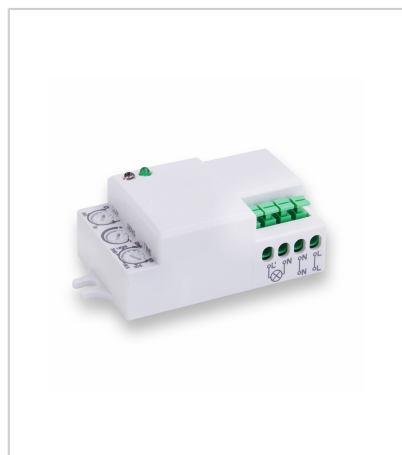
VT-8018 MICROWAVE SENSOR