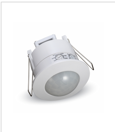
VT-8051 PIR CEILING SENSOR-WHITE