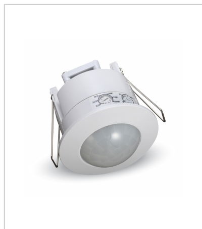
VT-8029 PIR CEILING SENSOR