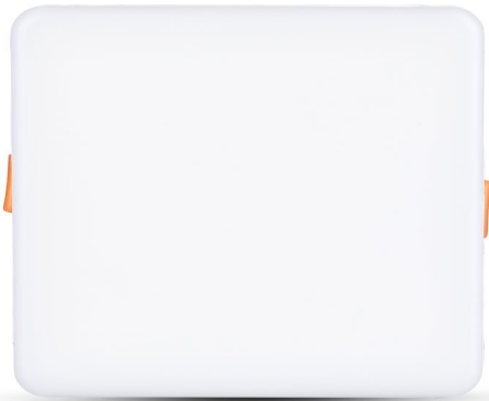
LED LIGHTING SQUARE